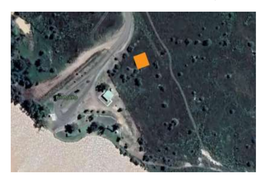
Figure 3: Detail of part of the Warrena Creek Reserve, with the proposed site of the 'Salute to the Land' lookout marked in Orange.

Proposed Location: Warrena Creek Reserve at Warrena Weir, Coonamble.