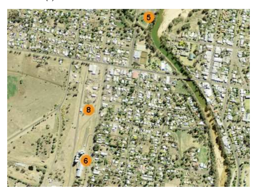
Figure 5: Locations of Project 5, the Tin Town Contemplation Circle north of Macdonald Park, Coonamble; Project 6, Silo Art and viewing area between Railway Street and Back Gular Road; and Project 8, the purchase and refurbishment of the Coonamble Railway Station and installation of a 'Stolen Generation' display in Railway Street, Coonamble.

Parameters: A three-part feasibility and business case (including detailed costings of ±30% accuracy and listing authorising agencies from whom permission must be sort, along with a proposed project plan, where relevant, with key milestones, from design, through detailed authorisation by agency, to construction and opening), for: