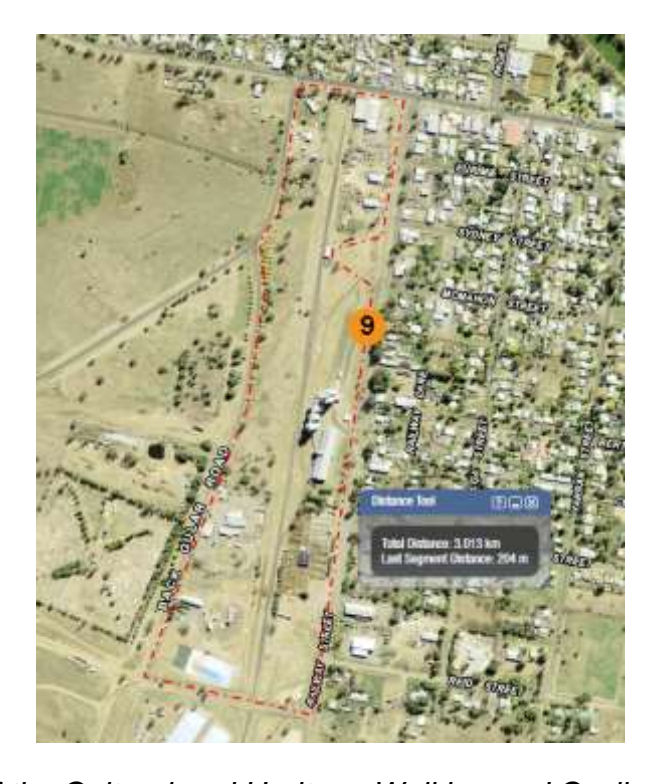
Figure 7: Part of the Cultural and Heritage Walking and Cycling Path (Project 9).