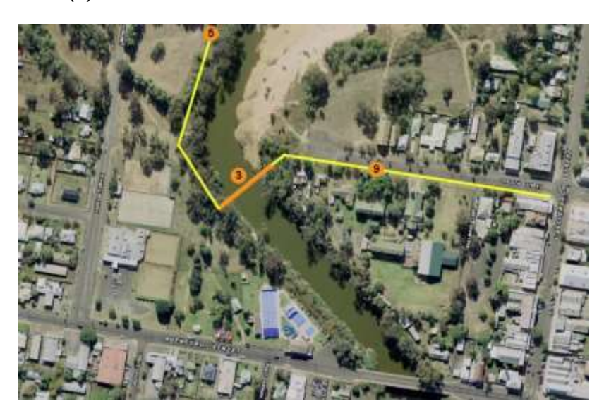
Figure 6: Location of the proposed pedestrian suspension bridge over the Castlereagh River from the end of Tooloon Street to Macdonald Park (Project 3), and part of the Cultural and Heritage Walking and Cycling Path (Project 9), linking to the Tin Town Contemplation Circle (Project 5).