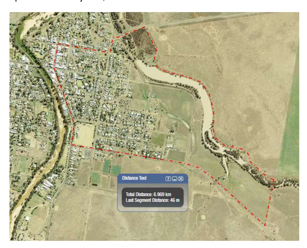
Figure 4: Location of the 7km concrete walking and cycling path (shown in red), connecting the Castlereagh River, from Smith Park, through town to the Warrena Creek Reserve.

Installation of a 7km concrete walking and cycling path (Project 7), connecting the Castlereagh River and Warrena Creek Reserve, of about 6km of new pathway at 2.5m wide, that would require a low-level culvert-type crossing downstream from the Warrena Weir and a pedestrian bridge, about 85m long x 2.5m wide, across the Warrena Creek at the easterly end of the reserve. This would also be incorporated into Project 9, the