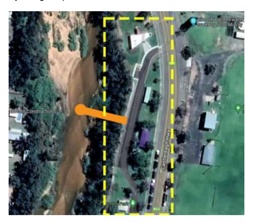
Figure 2: Smith Park outlined in yellow, with the proposed cantilevered river viewing platform shown in orange.

Proposed Location: Smith Park, Coonamble, incorporating the Coonamble Information and Exhibition Centre, with the cantilevered River Viewing Platform situated midway along the park.